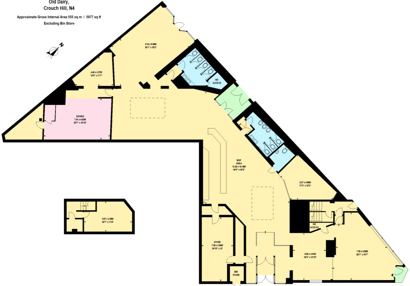
Basement 267 sq m / 287 sq ft