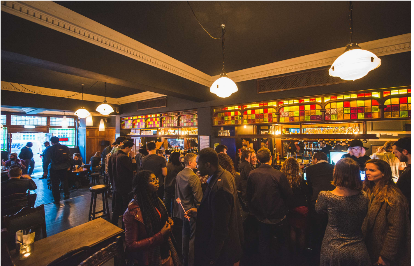
Ground floor trade area