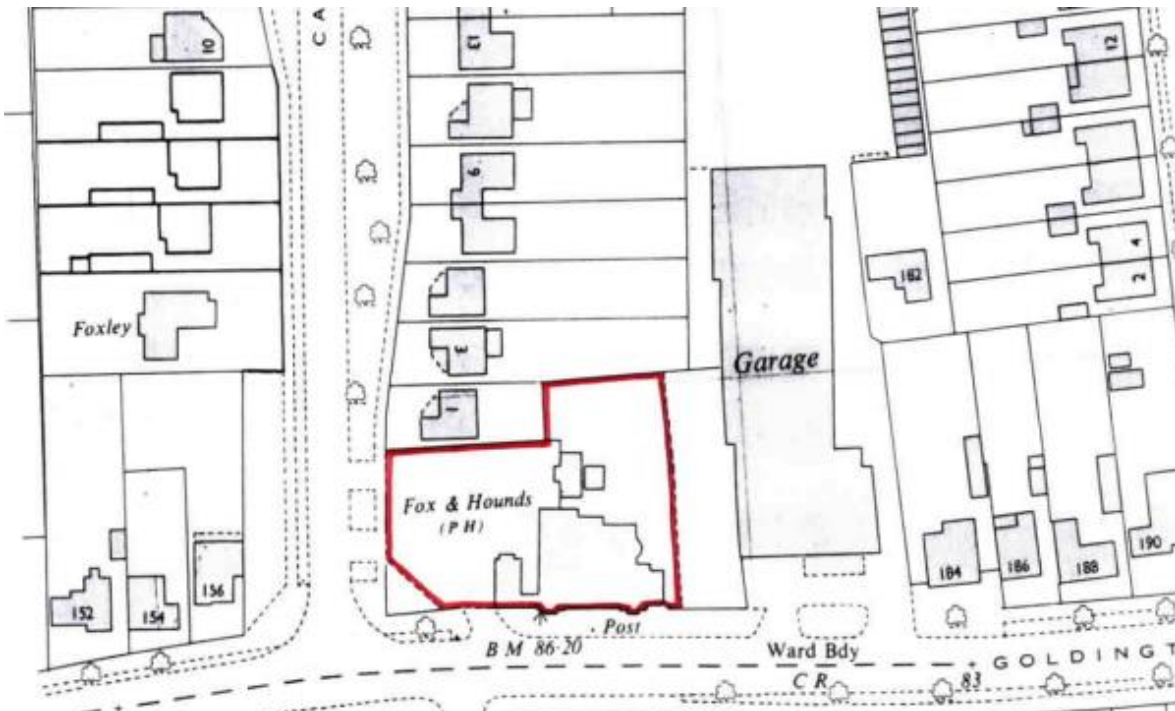
Not to scale – Historic site plan, provided for indicative purposes only