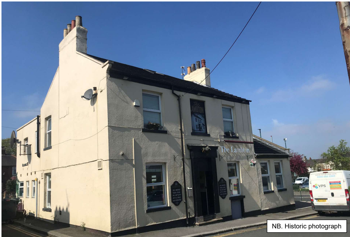
NB. Historic photograph