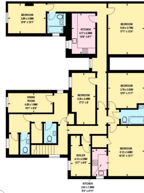
First Floor 180.8 sq m / 1958 sq ft

The above floor plans are not to scale and is provided for indicative purposes only.