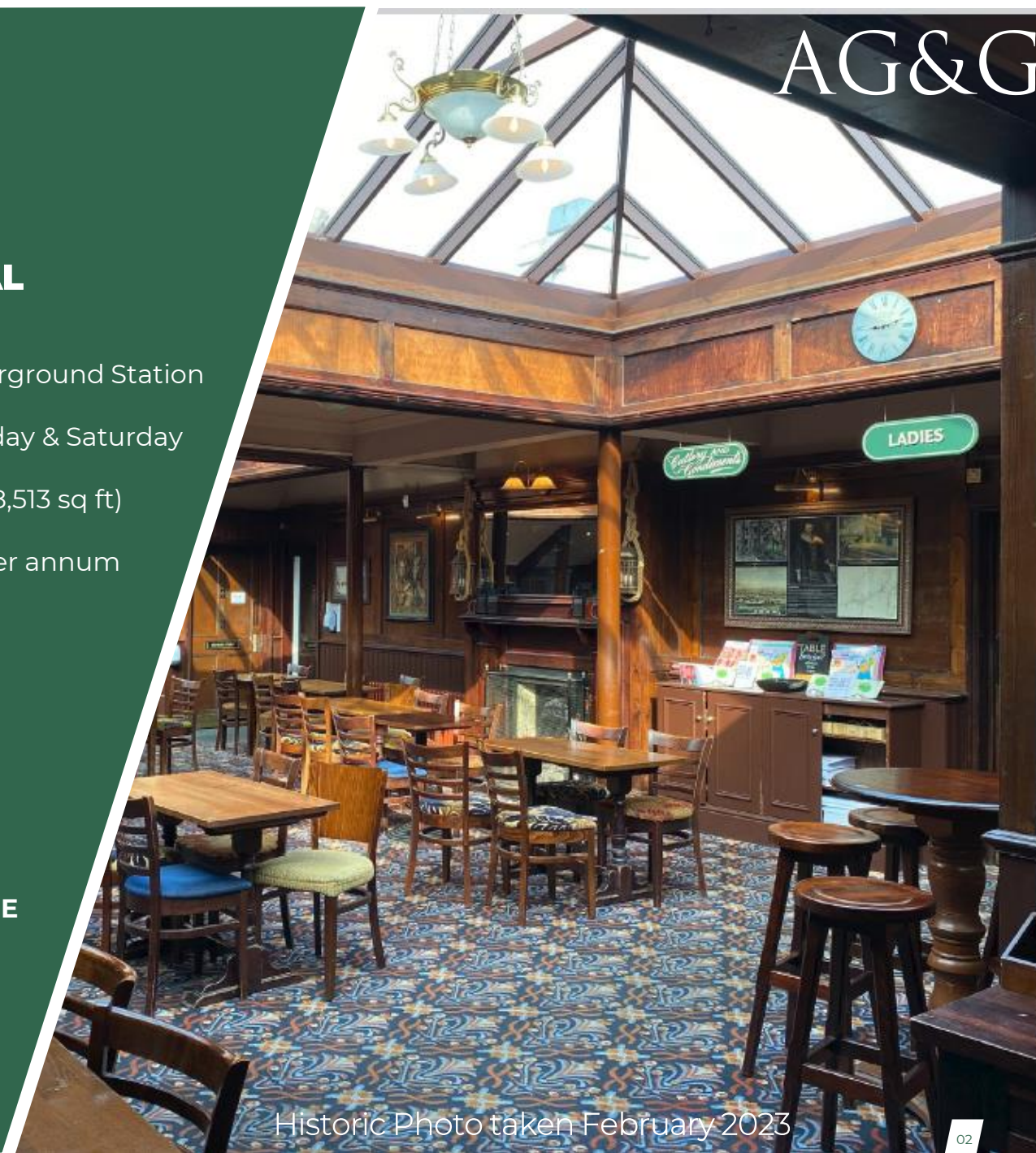
Historic Photo taken February 2023