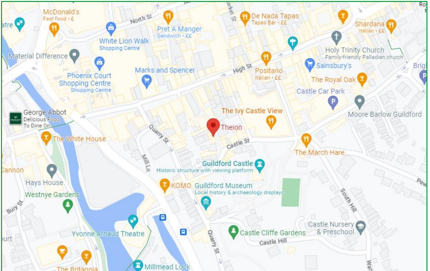
Not to scale - Provided for indicative purposes only.