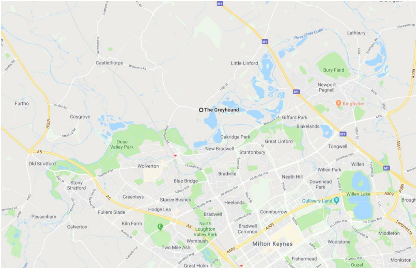
Not to scale - Provided for indicative purposes only.